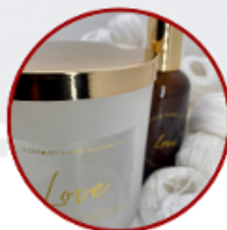
HOME + BODY